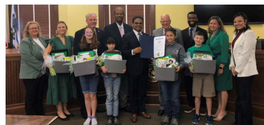
National 4-H Week recognition at the County Commissioners Court meeting - October, 2023

"I am grateful for the opportunities 4-H offers to my child, the essential life skills they have instilled, and the connection to peers with similar interests that the team has facilitated. I look forward to many more years of participation."