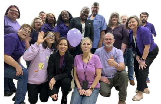
Staff development activities include occasional "pep rallies" and get togethers. We had a purple party to celebrate good health in March, 2024