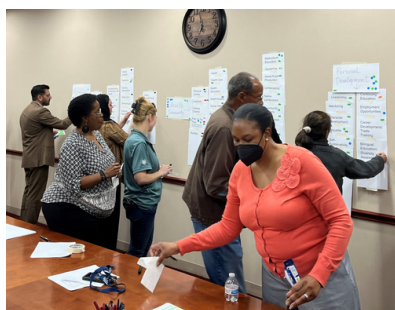
Combining and prioritizing issues at final meeting

One of the biggest events of the year is the Annual Vegetable Conference in February (pic below).