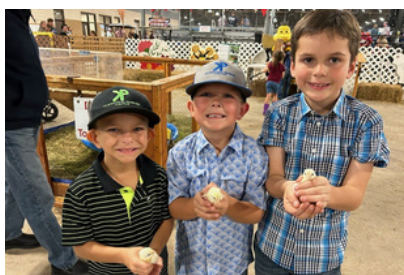
Boys and chicks at the AG'tivity Barn