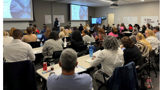
Fort Bend County and Harris County staff participated in an Urban Programming Workshop (held in the Fort Bend County OEM training room) to discuss planning and collaborate on effective strategies in urban environments in August, 2024.