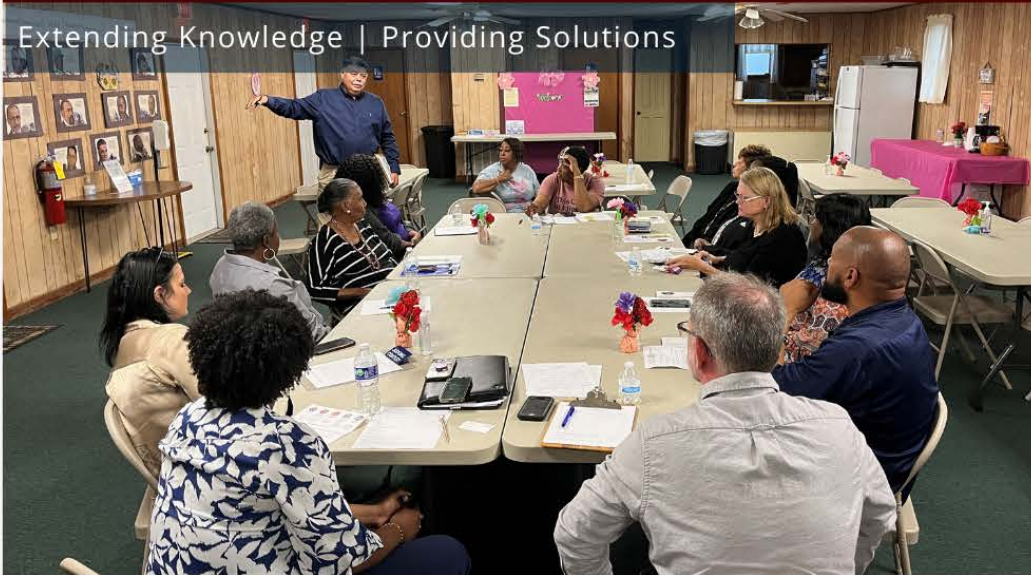
Thoughtful conversations occurred at in-person meetings.

Extending Knowledge | Providing Solutions