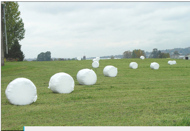
Figure 9. High moisture “haylage” bales individually wrapped in plastic.