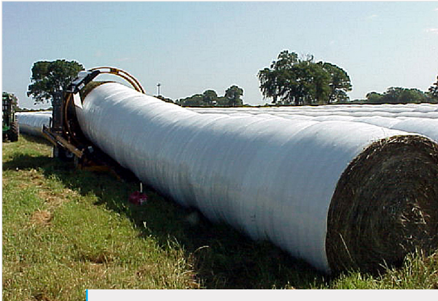
Figure 8. Multiple high moisture “haylage” bales being wrapped in plastic.

that typically occur in high-moisture bales. Haylage does not, however, attain as low a pH as silage so it cannot be stored as long. The cost to wrap long strings of round bales (Fig. 8) or individual bales (Fig. 9) is about $5 to $7 per bale. While haylage reduces leaf shatter loss and allows you to preserve high-moisture forage, it is typically fed on-farm because it cannot be moved easily.