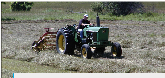
Figure 4. Dried forage being raked into windrows.