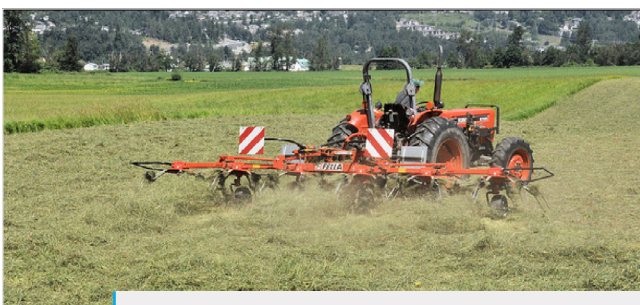
Figure 6. Tedder used for inverting dried forage to speed drying.

After cutting, the hay should remain in the field to dry or “field cure.” The dried or cured forage is then raked (Figs. 4 and 5) into windrows that are the width of the take-up header of the baler. Sometimes a heavy dew, high relative humidity, or rain will cause the windrow to be dry on top but wet underneath. When this happens you can use an implement called a tedder to turn the windrow over to help it dry (Fig. 6). Once the moisture content in the windrow has reached the appropriate level, the forage can be baled into round or square bales.