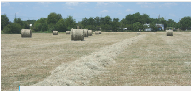
Figure 5. Dried forage after being raked into a windrow.