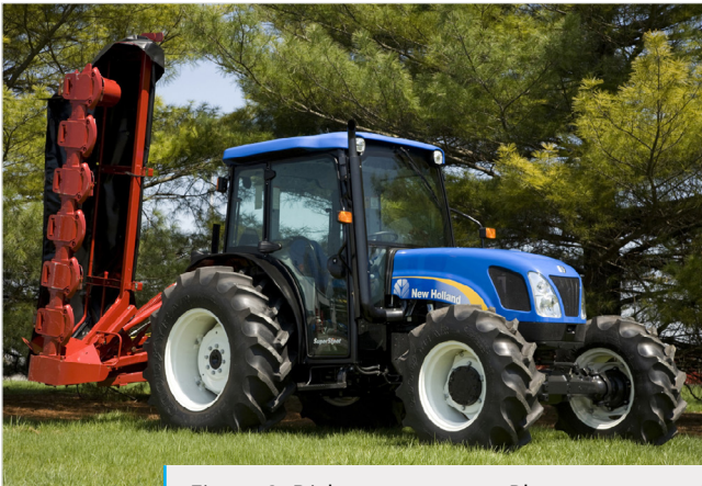
Figure 3. Disk mower cutter.