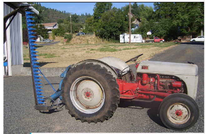
Figure 2. Sickle-bar type cutter.

The first step in hay production is the actual cutting of the hay. Hay mowers fall mainly into two classes — sickle-bar cutters (Fig. 2) and disk mowers (Fig. 3). Sickle-bar mowers have long cutting heads with reciprocating teeth. Disk mowers have cutting heads with several small rotating cutters. In the past, it was difficult to adjust cutting height and most mowers left a stubble height of 2 inches or less. Cutters today are more adjustable and a higher cut leaves some leaf material to support photosynthesis and encourages a more rapid recovery from the harvest.