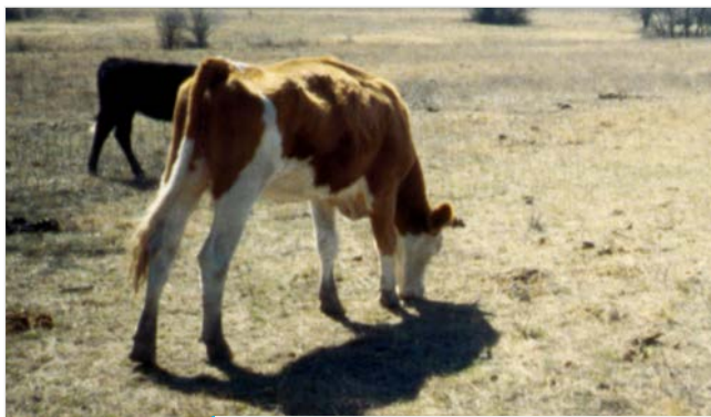
A pulled-down cow is at risk of contracting many types of diseases.

As a cow-calf herd goes into the fall season after a hot, dry summer, the entire herd may be stressed. Excessive heat, short grass and low water tanks stress cattle and make them more susceptible to diseases. Unsanitary conditions and abrupt diet changes also can lead to illness, as can other circumstances of stress. At the end of the summer, the cows are likely pulled down to a thin body condition from nursing the calves, the bulls worn out from breeding, and the calves shocked from weaning.