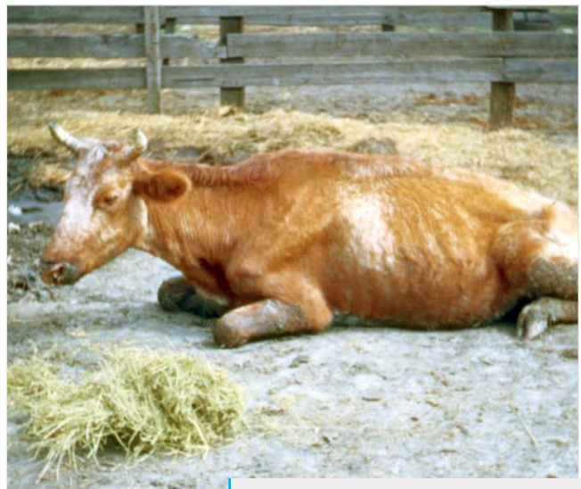
In many cases, cows that advance to the “downer” stage may die.

No matter when the cattle are turned onto “poor” oak tree pasture, remember that they still could be affected if they eat too many acorns.