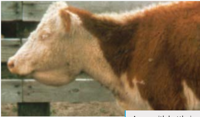
A cow with bottle-jaw.