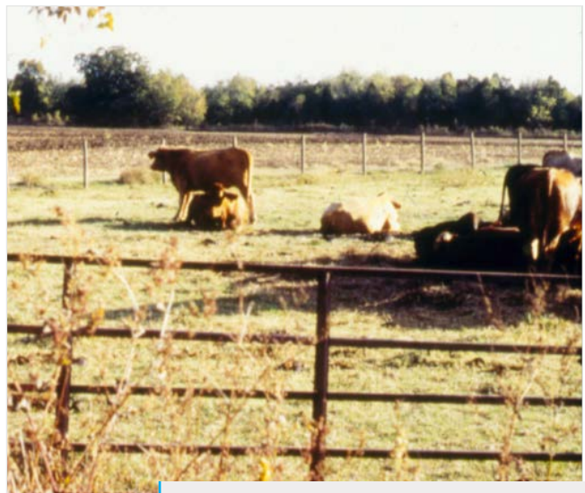
Nasty ground in haying and loafing area can lead to soil-borne diseases in cattle.